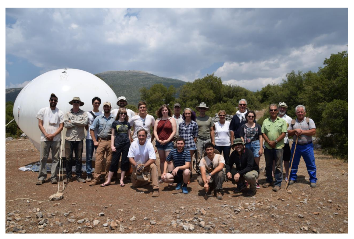
Figure 8. The first team in 2016 (colleagues, students, workers) besides the helium balloon for aerial photos.

As I mentioned above, the expansion of the pastoralists of the Yamnaya steppe about 5,000 years ago, invaded and imprinted its origin in Eastern Europe in the west, in the Balkans and Greece, and in the east across the Caucasus to Armenia. However, they did not affect Anatolia – they bypassed it. Eastern huntergatherer ancestry drops to less than 4% in Mycenaean Greece where Kastrouli is located. Thus, our data from Kastrouli help document the final process of Yamnaya extension in the southern arc.