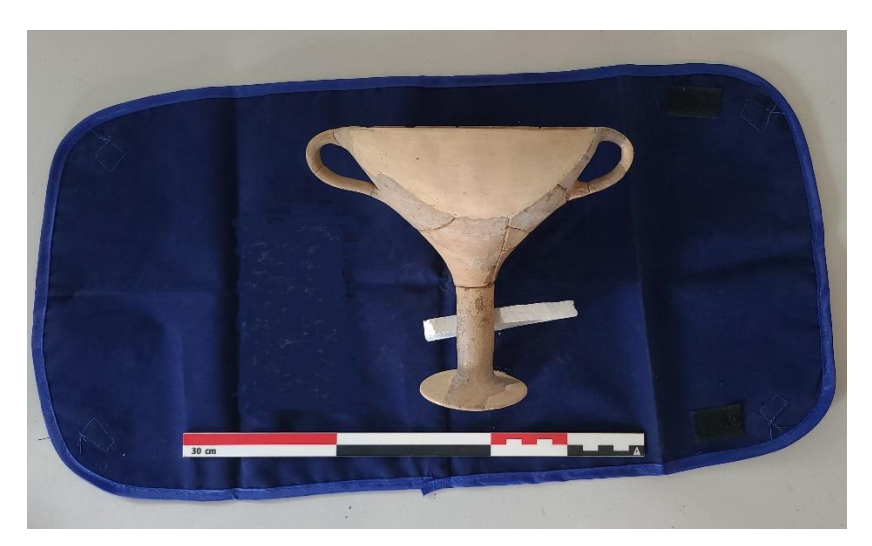
Figure 4. The high stemmed conical kylix from Building 1 restored. (see, Sideris 2022).