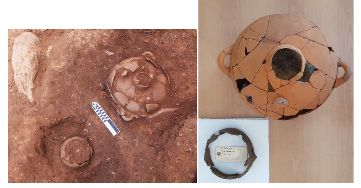
Figure 6. UP: The hydria & the oenochoe during the excavation of Building 1, 2017. LOWER: The objects after the first maintenance (conservation-restoration) work (under the supervision of Dr P. Manti, Ionion University, Greece).