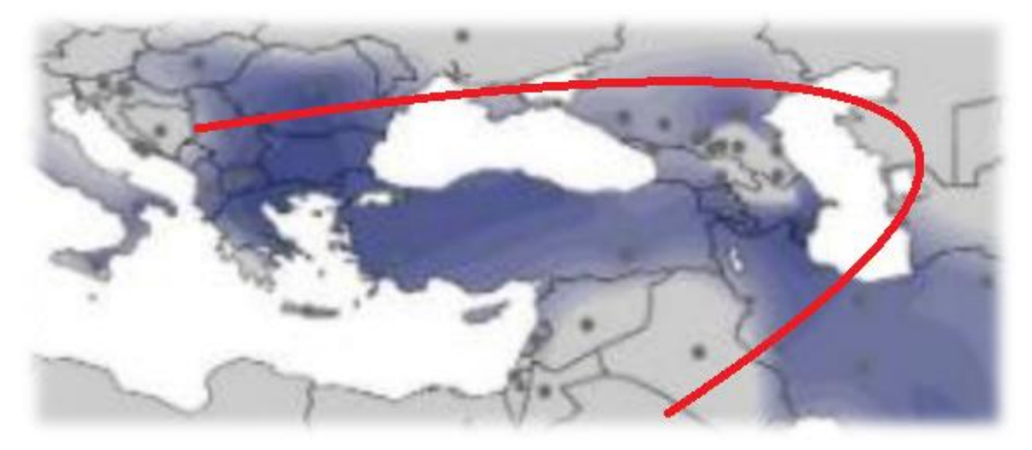
Figure 1. The sketched approximate southern Arc (Greece-Balkans-Black Sea-Anatolia-Caucasus-Armenia-Levant)

In this arc, various ancient human civilizations formed and spread. These civilizations, which have either been lost to history or have survived to this day, are not only the legacy of the inhabitants of the present-day region they left behind but have had a profound effect on human civilization as a whole.