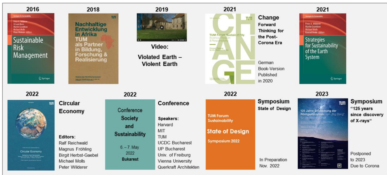
Figure 3: TUM Forum Sustainability – Symposia & Publications since 2016

Figure 3 provides an overview of SEF publications to date. The 2022 Symposium (November) is dedicated to the topic of “design.” This interdisciplinary conference will discuss the meaning and role of design and design methods in business, culture, science, and technology – sectors of society with different, sometimes opposing interests, whose decisions and activities necessarily influence each other. The goal of these discussions is to work toward a standard definition that explains what design is and can be, with its many facets, across the disciplines. A conference volume will be published in 2023. Other fora on emerging topics are already in planning.